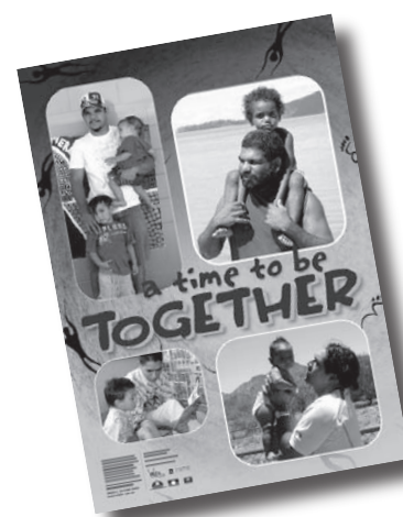
One of the National Parenting and Men posters the SRS produced. They were launched in Tasmania in August.

A project proposal about how to gather, document and share information for this overarching project activity will be